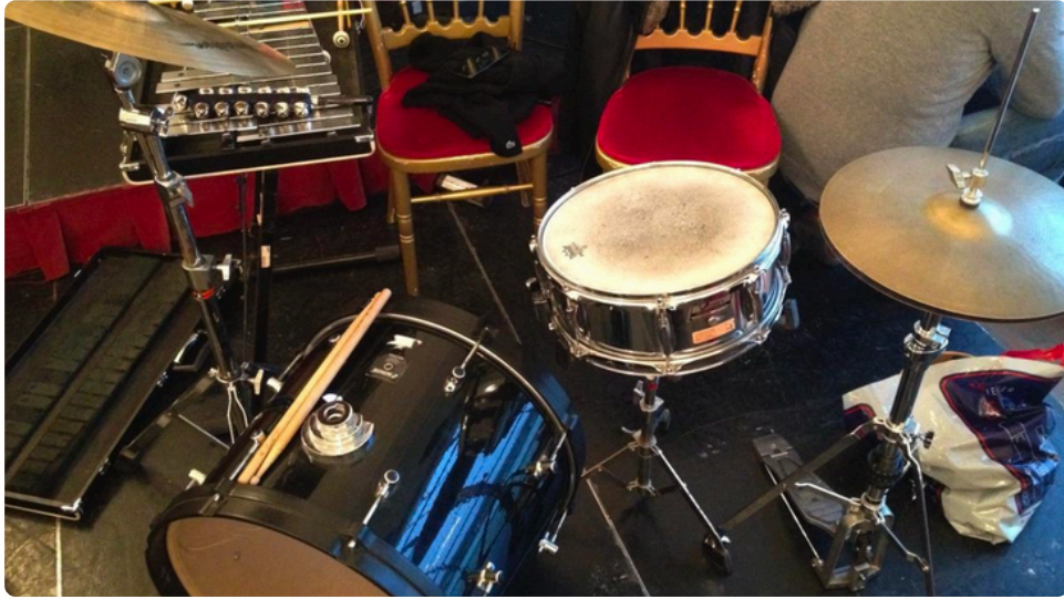
COMPLETE DRUM SET